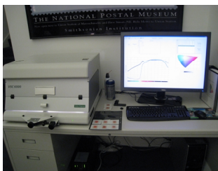
The Video Spectral Comparator 6000 at the Smithsonian National Postal Museum in Washington, DC

Our web site provides a list of our active alliance partners.