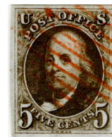
Blackish Brown

in trace amounts. This observation proves that quartz (SiO 2 ) contamination could not have caused the progressive wear evident in successive printings of this stamp. More work is planned to identify the specific lead compounds contained in the pigments used.